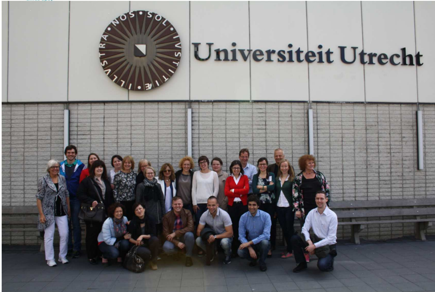
First event - May 2015, Utrecht University, The Netherlands

A European Network with a Global Outlook