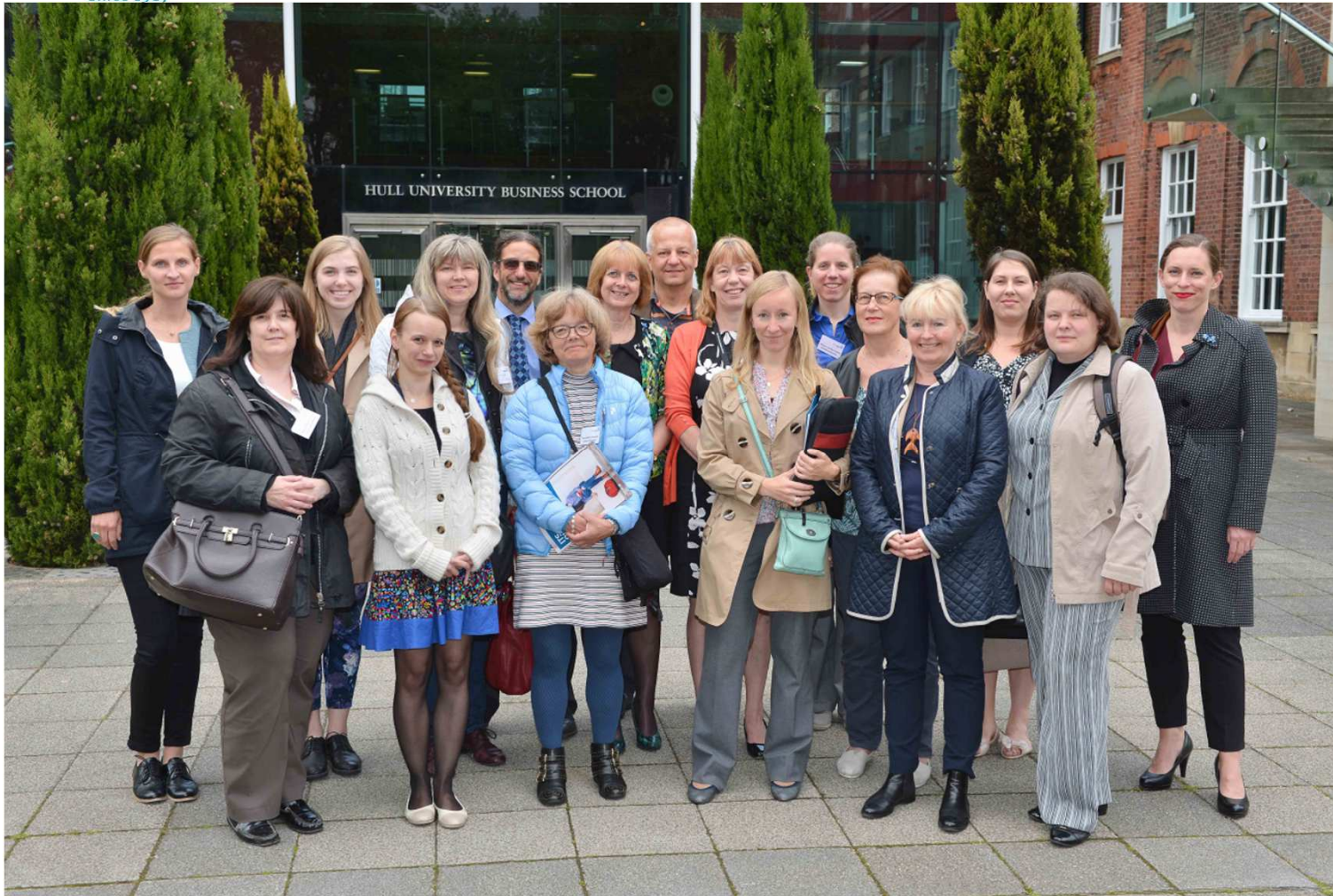
Research Management workshop - May 2016, University of Hull, UK

A European Network with a Global Outlook