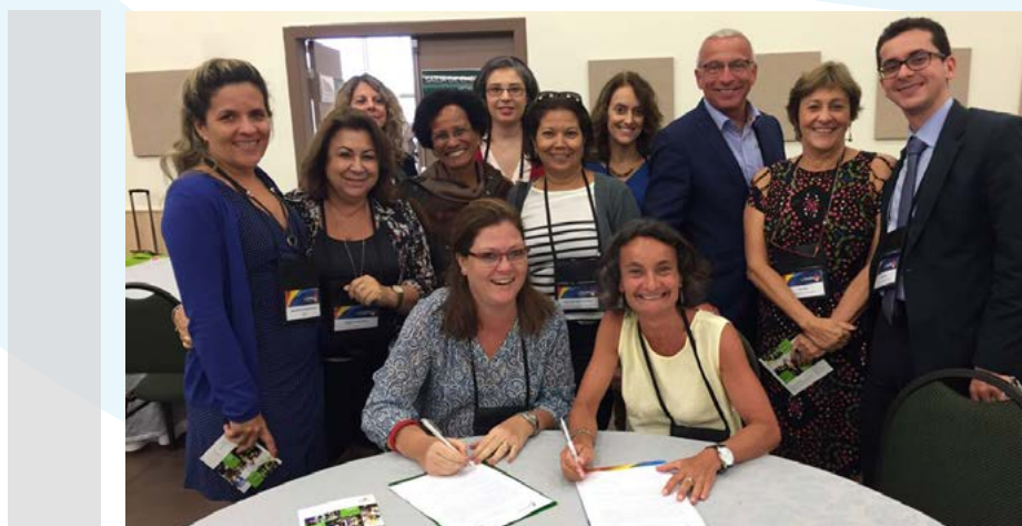
Utrecht Network and REARI-RJ colleagues at the 2016 FAUBAI Conference